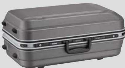
Lens Case CT-608 (included)