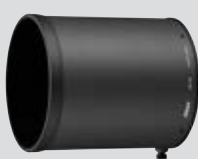
Lens Hood HK-40 (included)